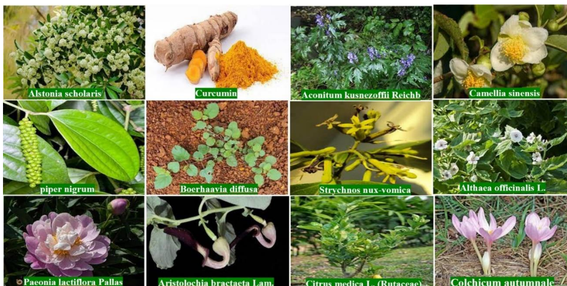
Figure 2. Medicinal Plants Effective on RA

Peiminine , an active substance extracted from Fritillaria thunbergii , is widely utilized in Asian countries due to its numerous health benefits. According to previous research, peiminine has anti-inflammatory, anti-cancer, and antioxidant properties. It's been found to suppress the release of inflammatory cytokines such as IL-1 \beta and TNF \alpha , which cause inflammation, in a dose-dependent manner by blocking NF- \kappa B signaling pathways and suppressing cytokines. Peiminine has been shown to be effective in alleviating the symptoms of rheumatoid arthritis, which is characterized by joint inflammation. Figure 2 shows some other medicinal plants that can be used to improve the symptoms of RA. 41