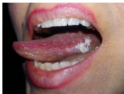
Figure 4. Leukoplakia as a Non-homogenous White Plaque on the Lateral Border of the Tongue.