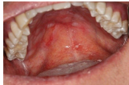
Figure 7. An Intact Vesicle on the Soft Palate Due to an Allergic Reaction.

Pustule: It is described as a purulent (pus-filled) vesicle. Pustules are usually creamy white in color but may be yellow or green. 7,9 Although, the presence of pus usually suggests an infection, there are many sterile pustules. 7,13 These lesions are usually smaller than 10 mm but may be seen in any size. 12 In the oral cavity, a pustule presents as a pointing abscess or