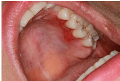
Figure 14. Erosion of the Palatal Mucosa Due to Chemical Trauma.

Primary and secondary lesions can be compared in terms of their size, relationship with the surrounding tissue, and contents, for example vesicle and bulla are classified as primary lesion but they are different in their size. In addition, pustule and vesicle are represented as blister but their contents are different. 7,12 Except for papule, plaque, vesicle, bulla, petechia, and ecchymosis, other lesions may be seen in any size.