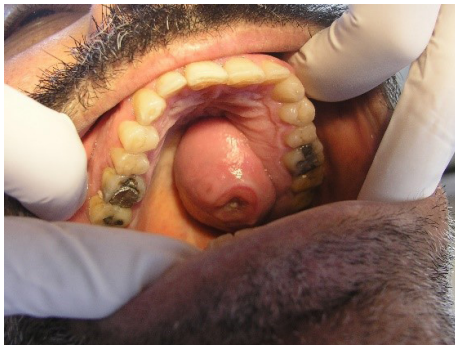
Figure 5. Mucoepidermoid Carcinoma as a Huge Tumor on the Posterior Portion of the Palate.