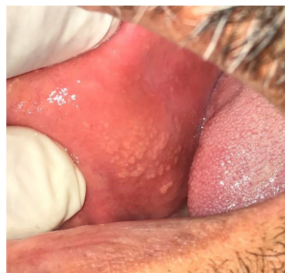
Figure 3. Fordyce Granules as Yellow Papules on the Buccal Mucosa.