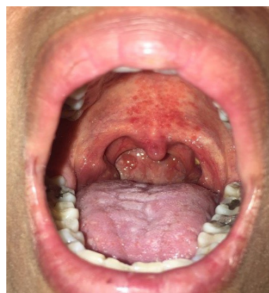
Figure 12. Diffuse Petechia on the Hard and Soft Palate After Viral Infection.