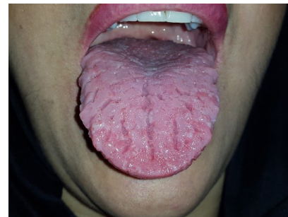
Figure 17. Fissured and Geographic Tongue.