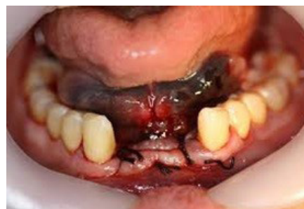
Figure 11. A Large Hematoma on the Floor of the Mouth After Surgical Procedure.

Ulcer: It refers to loss of continuity of the epithelium. The center of the lesion is initially red and then turns gray-