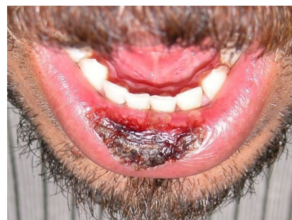
Figure 13. Crusted Ulcer in a Patient With Erythema Multiforme.

white after being covered with fibrin clot (Figure 14). 1,9 The periphery of the lesion may be erythematous. 2 Ulcers are further classified according to their depth, border, shape, margin, and the tissue at its base. Ulcers can be superficial or deep. Superficial ulcers have less than 3 mm depth while deep ulcers have over 3 mm depth. 13 In terms of shape, the ulcers can be divided into symmetric and asymmetric forms according to the degree of regularity of the borders. The margin of the ulcers can be smooth or craterlike when it is above the level of the normal mucosa. 16-18 Oral ulcers are the most common type of oral lesions such as recurrent aphthous stomatitis, traumatic ulcers, etc. 12