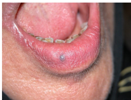
Figure 1. A Circumscribed Macule on the Lower Lip.