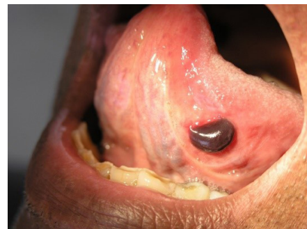
Figure 8. Hemorrhagic Bullae on the Lateral Border of the Tongue Due to Cicatricial Pemphigoid

parulis. Herpes zoster also produces pustules that eventually ulcerate and cause intense pain. 12