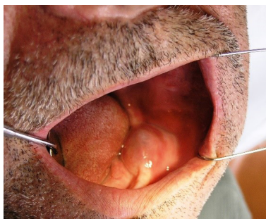
Figure 10. Residual Cyst With Bucco-lingual Expansion and Perforation.

discoloration that varies based on its duration and does not blanch with pressure (Figure 11). Purpura can be divided into two categories of petechia and ecchymosis according to the size of lesion. Petechia is defined as tiny, 1 mm to 2 mm pinpoint non-blanchable purpuric macules resulting from the rupture of small blood vessels and can be red, purple or brown in color. 1,7 Ecchymosis is also described as a non-blanching, purpuric macules greater than 3 mm in diameter due to extravasated blood in the skin or mucosa. Over time, the color may change from blue-black to brown-yellow or green before fading away. 7