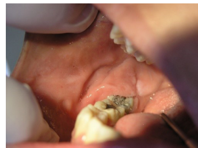
Figure 18. Scar Tissue on the Posterior Portion of the Buccal Mucosa After Surgical Procedure.

However, some researchers have suggested a 5 mm or 10 mm cut-off point for papule, plaque, nodule, macule, patch, vesicle and bulla. 1,7-9 An international committee, in its English and German branches, has defined papule to be less than 5 mm in size. It seems to be the most logical size. However, the French and Spanish branches of international committee, still report 10 mm as the maximum size. 23 According to the English and German versions of international committee report, plaque is defined as an elevated area of skin 20 mm or larger in diameter. Therefore, raised and flat topped lesions, which are between 5 mm and 20 mm in size, have no official definition. The result is choosing a small size (5 mm) for the maximum size of the papule. In contrast, the cut-off point between a papule and a plaque is 10 mm according to the French and Spanish branches of the international committee. 23 The maximum size of a nodule is considered to be 5 mm; however; this value is 10 mm according to the French version of the international committee; whereas, the Spanish version does not mention any size. 23 The international committee has not provided a size