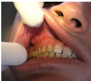
Figure 9. Dental Abscess Due to a Necrotic Tooth.