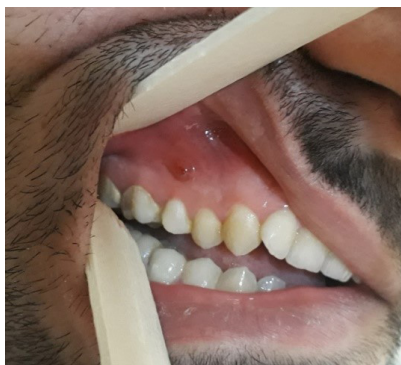
Figure 15. Sinus Tract in Association With a Necrotic Tooth.